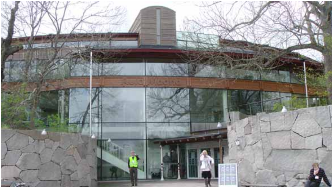
AULA MAGNA HALL ( The Nobel prize recipient winning memorial lecture venue )

AULA MAGNA Hall ( The Nobel prize recipient winning memorial lecture venue )